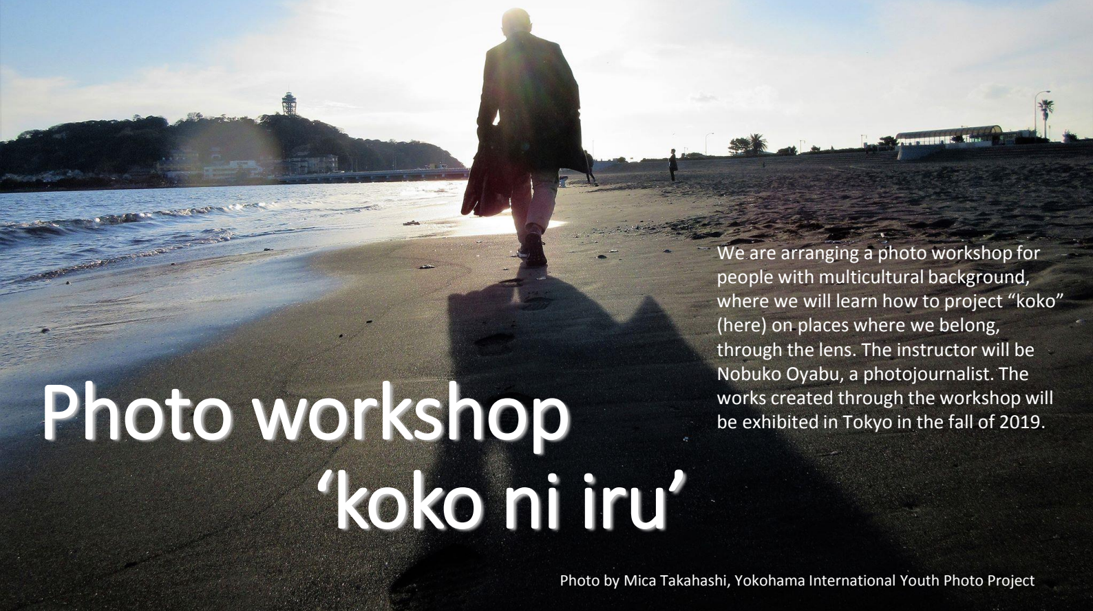
Photo workshop 'koko ni iru'